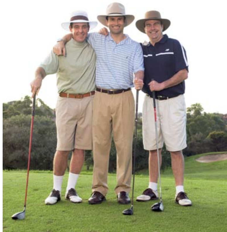
Toowoomba Grammar School

Over the years Akubra has maintained its ability to be in vogue. Our hats have become a vital part of Australia's identity; worn by soldiers, Olympians, politicians, personalities and of course, loyal, everyday countrymen and women. Akubra produces a wide selection of fur felt and straw hat styles to suit all wearers, and all occasions from Western and Country shapes through to casual and formal fashion hats.