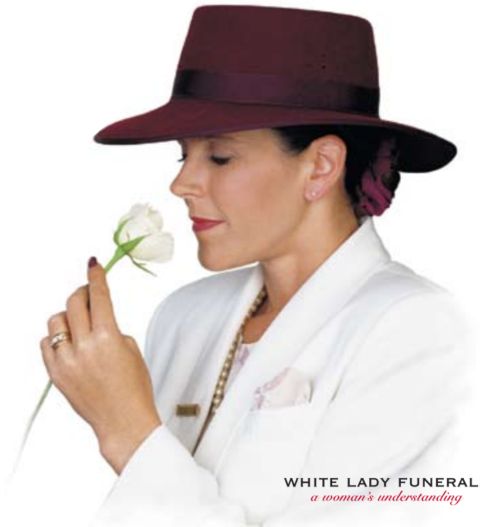
WHITE LADY FUNERALS a woman's understanding